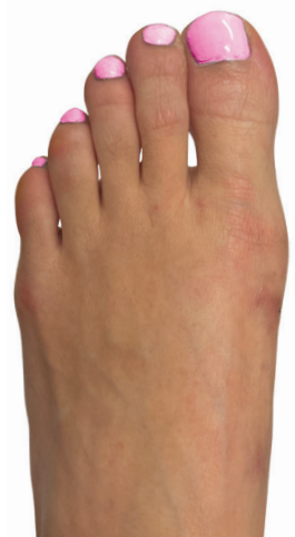
Be Bunion Free®